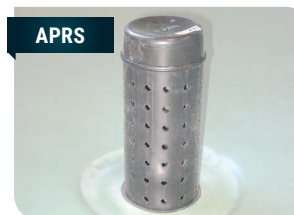
Poly riser screen