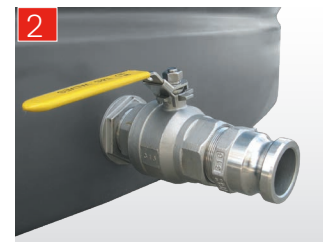
Ball valve and camlock