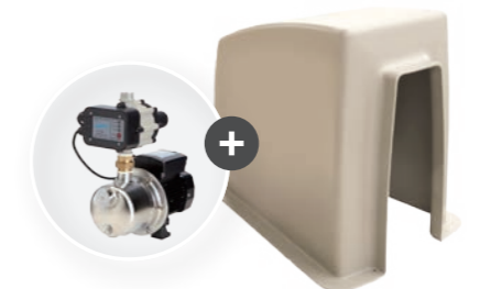
▲ PH400 or PH550

The Packaged Pump Unit sits neatly beside any size tank and includes a pump protected in a poly pump house cover.