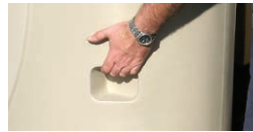
Hand grips for easy lifting