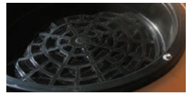
Mosquito Proof Leaf Screen