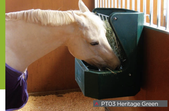
PT03 Heritage Green