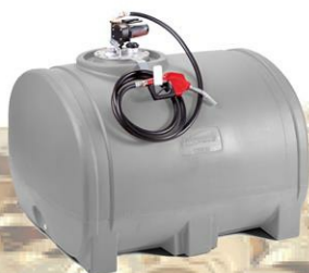
DIESEL TRANSFER SOLUTIONS