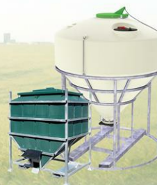
SILOS & BULK STORAGE