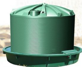
STOCK-WATERING TANK & TROUGH