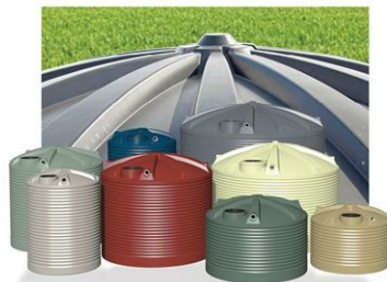
200 – 50,000L WATER TANKS