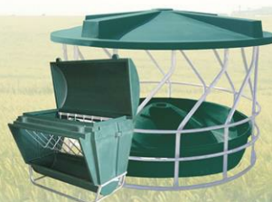
HAY & GRAIN FEEDERS