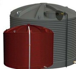
PIPELINE & FERTILISER TANKS

*Seek professional advice for Polymaster products applicable for you!