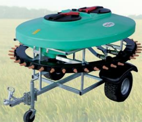
MOBILE MILK FEEDERS