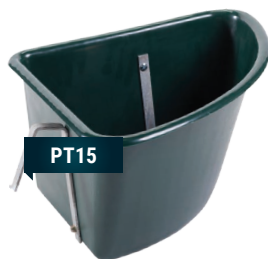
32 Ltr Corner Feeder