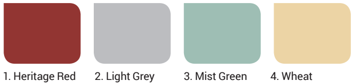
1. Heritage Red 2. Light Grey 3. Mist Green 4. Wheat