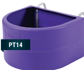
32 Ltr Stable Feeder with Brackets