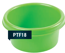
18 Ltr Tyre Feeder