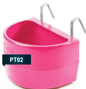
45 Ltr Feeder with Brackets