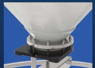
200mm Dry Bulk Outlet