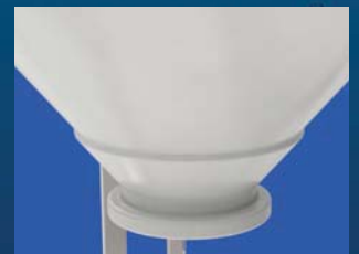
200mm Flanged Outlet