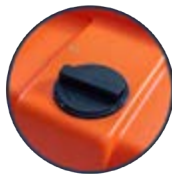
140mm Vented Lid (Ute Pack)