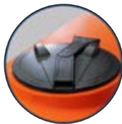
Quarter Turn Hinged Lid (Water Cartage)