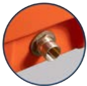
Brass Threaded Outlet