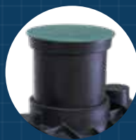
Optional 500mm Riser Available