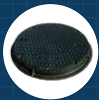
Class D Lid Available