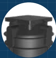
Square Lids Available